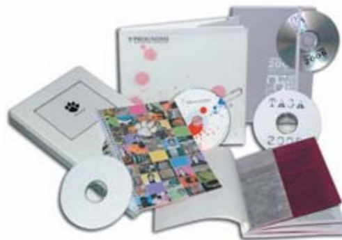
Taga Student Publications