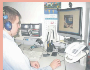
Workplace of distance learning tutor