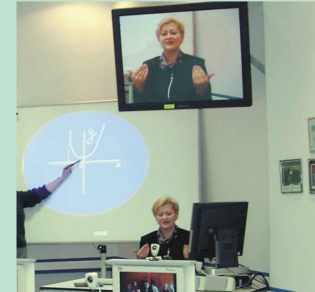
Sign language interpreting