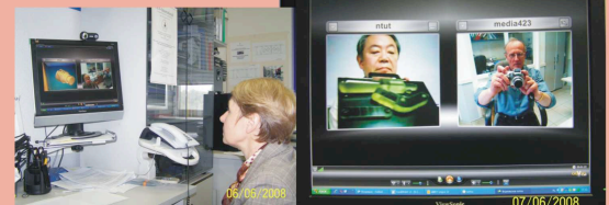
Videoconference Russia - Japan