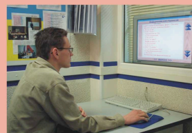
Information system for the deaf and hard-of-hearing students at BMSTU Center