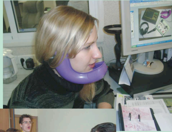
Training on hearing and speech development