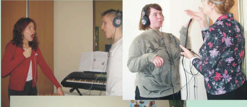
Special communication training