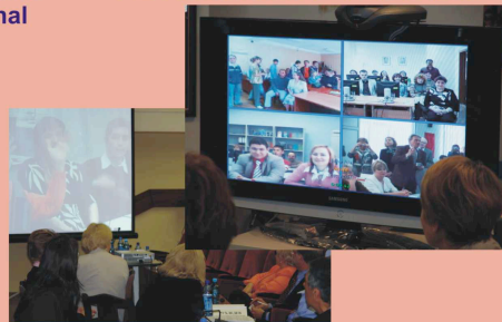
Multi-points video conferences system of PEN-International - PEN-Russia