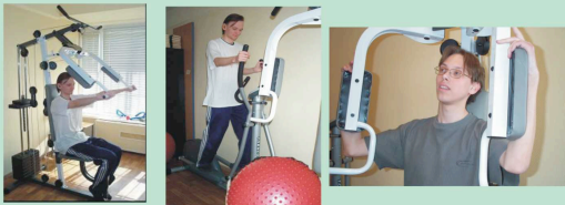
Athletic training simulators at the campus for the deaf and hard-of-hearing students