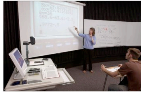
High technology classroom

Wireless, cellular, messaging, and personal digital assistants.