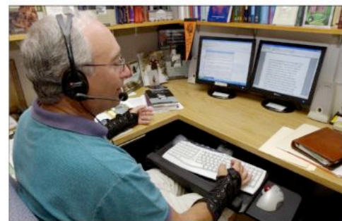
Voice Recognition Technology