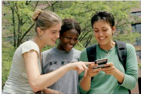
Students Using a Sidekick

Many existing and developing technologies have significant potential to serve as effective “access technologies” for deaf people. To address the