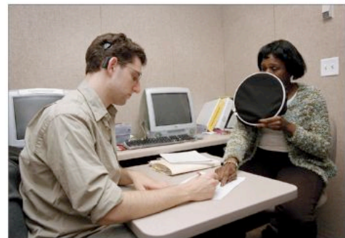
Cochlear Speech Training