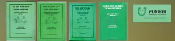
4 Books published in Dec, 2007