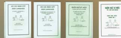
4 Books published in May, 2007