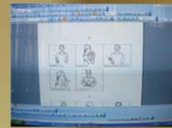
Organizing the Vietnamese to HCMCSL Dictionary by the Vietnamese Alphabet