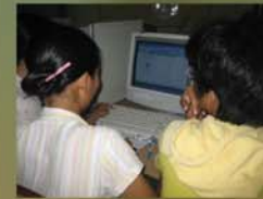
Organizing the HCMCSL English Dictionary by the Handshape of the Signs