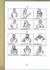
Example Page From Vietnamese to HCMCSL Dictionary