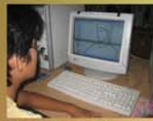
Producing Line Drawings from Photoshop