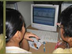
Organizing HCMCSL Signs with the Same Handshape By Orientation and Location