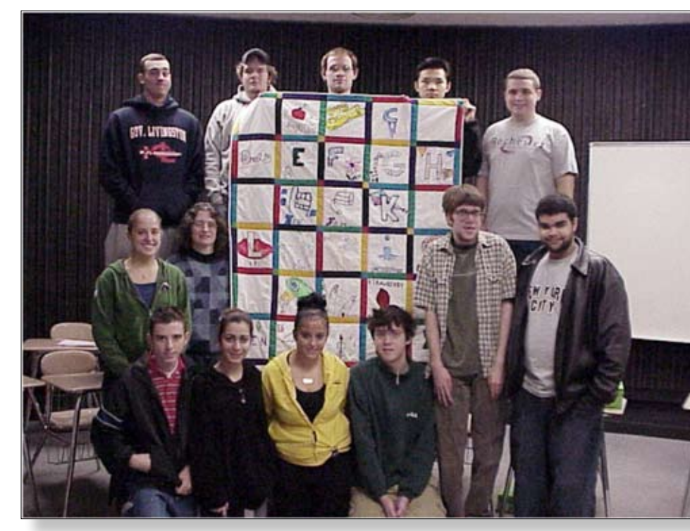
Initial service-learning activity: Students designed quilt blocks that were assembled for final class.

I think that interested to me charity things like kid's quilt or what others.