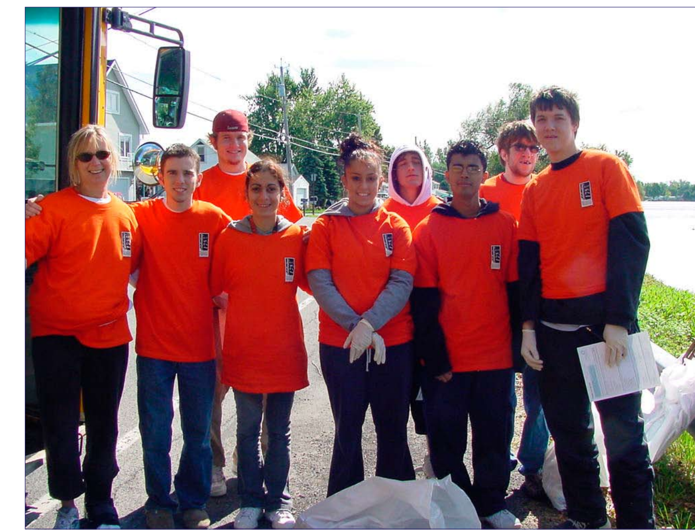
Class photo of Intercoastal Highway Clean-up Project

When we went to by the lake for community service. It's make place a clean but we look like a prisoner in orange clothes . We made that guy a proud that we helped and clean up the places and also the trashes too. It's make me feel good to help to other people