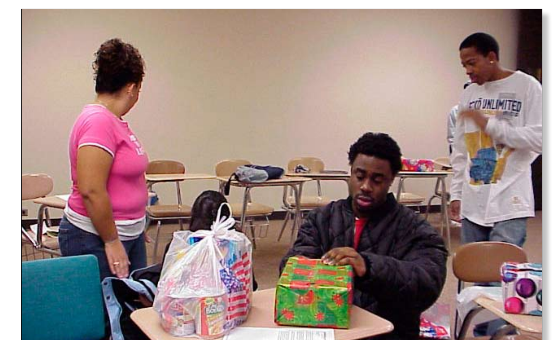
Students prepare "gifts" for the Open Door Mission

One of the biggest issues with the portfolio system appears to be that deaf and hard of hearing students with weaker writing and English language skills frequently did not participate in the discussion posts. However, for the majority of students the portfolio system appeared to be a positive experience.