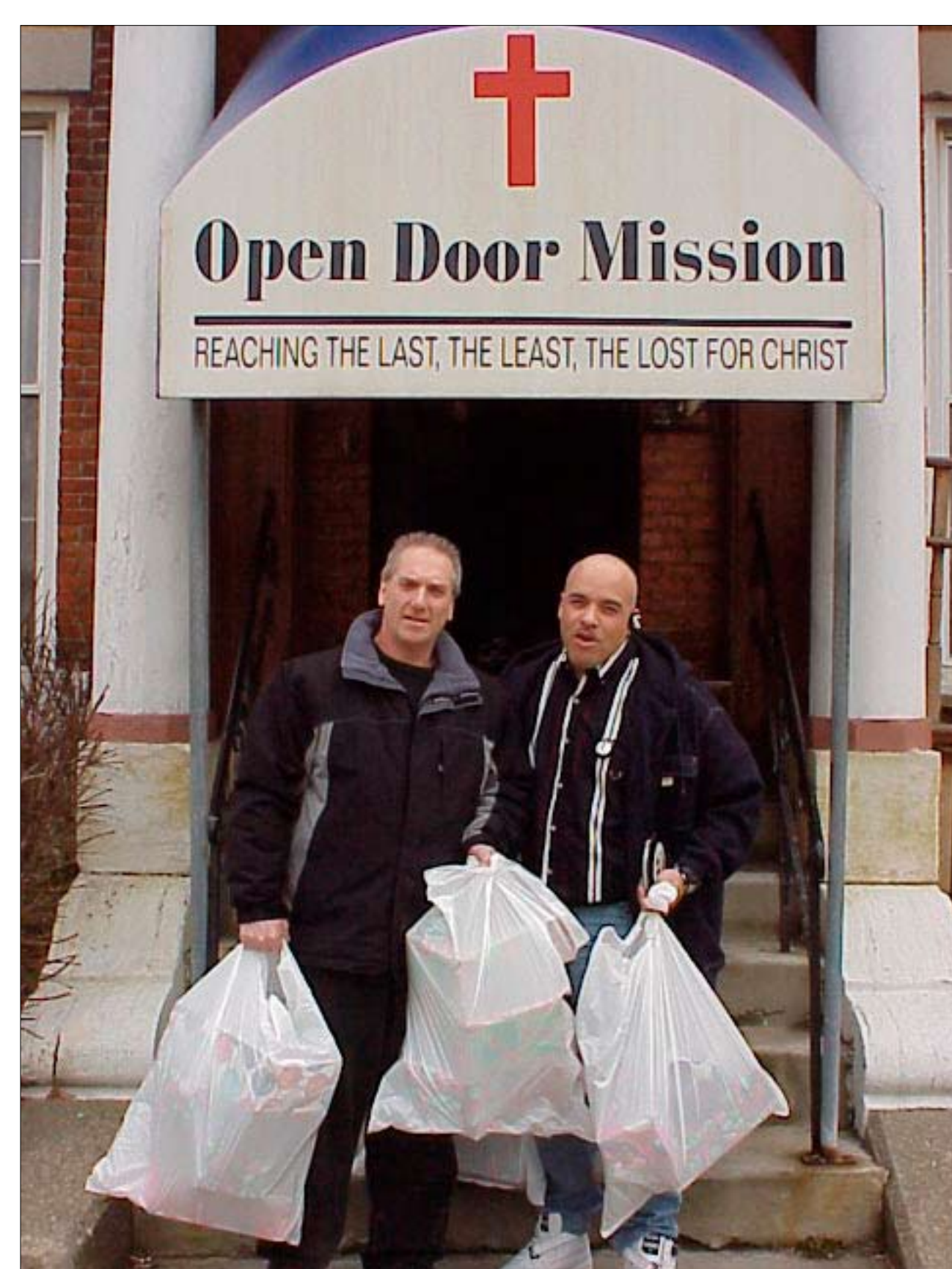
Recipients of student "shoe boxes" for homeless individuals in Rochester

Initially, it was determined that "myCourses.rit.edu" (Prometheus™) would be used as a means to organize individual student's thought processes. "MyCourses.rit.edu" already existed within the college as a tool for providing lecture notes, homework assignments, and instructional handouts. Deaf and hard of hearing students (n=17) enrolled in Freshman Seminar posted in the "Discussions" of "myCourses" every seven to ten days. The posts, e-mailed questions/responses between instructor and students, and photos of class activities were assembled in a hard-copy "scrapbook" format at the end of the quarter to document student progress. Students completed the NTID Student Rating Survey (SRS) at the conclusion of the course to evaluate the perceived benefit of web-based portfolios. Summary results of questions will be shared along with student "scrapbooks."