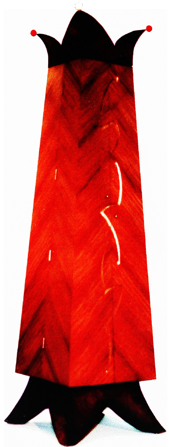
THE FOOL Liquor Cabinet Afromosia, Citrus, Pearwood veneer Cooper and glass