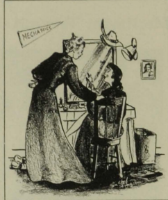
"It's a wonderful new lipstick—with a glue base!"