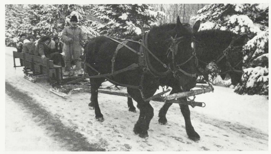
WINTER WEEKEND...Theme for the weekend was "Year of the Tiger" but obviously some RIT students prefer horses. Free rides across the Quarter Mile in a horse-drawn sleigh were among many of the events held during Winter Weekend, Feb. 6 to 9.

The RIT Dance Company Concert will be presented by the RIT Creative Arts Program in conjunction with the NTID Department of Performing Arts, Feb. 21 and 22 at 8 p.m. Tickets are $2 and will be available at the NTID Theatre Box Office in the Lyndon Baines Johnson Building weekdays beginning Feb. 10, from 10 a.m.-4 p.m. For information and reservations, call -6254 (Voice/TDD).