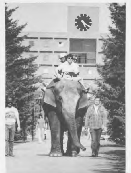
RIDING HIGH...Buelha, an 18-year-old Asian elephant, takes some passengers on a walk down the Quarter Mile during RIT's annual Spring Weekend celebration. Although she was pleased to give rides, Buelha put her foot down when it came to a tug-of-war planned Friday evening, May 8. Other Spring Weekend events included concerts, earth ball contests, rappelling, psychic readings and an art show.