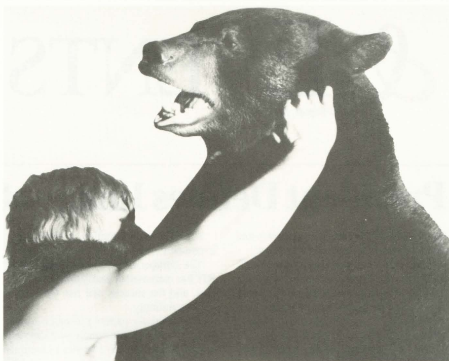
Caesar the Rasslin' Bear