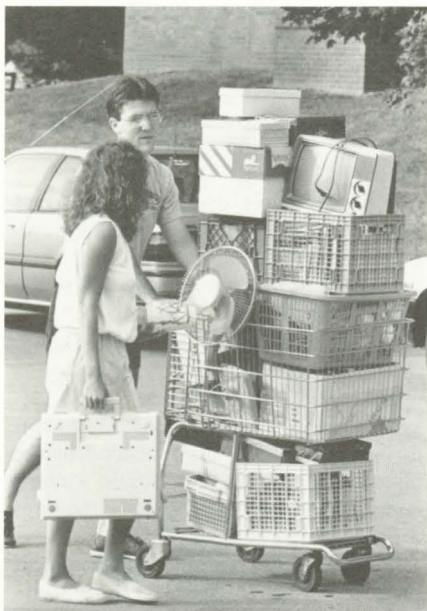
Move-in day saw new students lifting and toting on the way to their new campus homes.