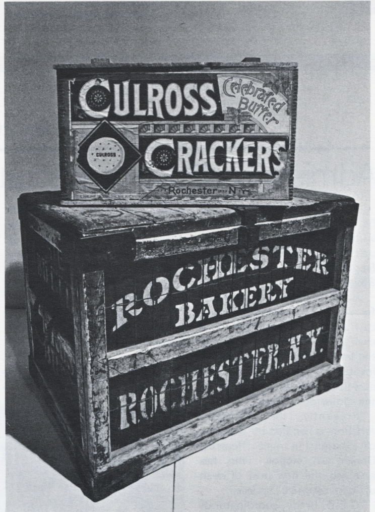
Antique packages photographed at Memorial Art Gallery's "Made in Rochester" show.