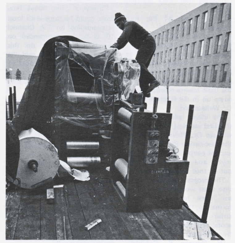
Gravure press being unloaded on campus.

"We are very grateful for the company's continued interest and support of the Institute, particularly in these challenging cont'd p. 4