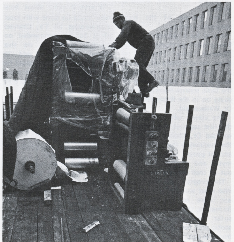
Gravure press being unloaded on campus.