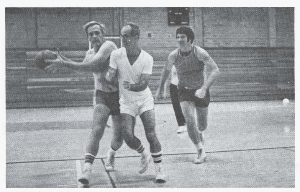
NOON HOUR WARRIORS

One Lomb Memorial Drive Rochester, NY 14623