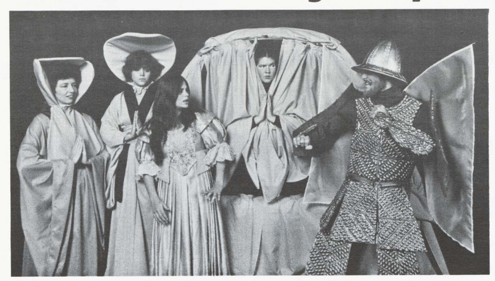
AN EVENING IN WONDERLAND

NTID Theatre production of Alice in Wonderland will be featured in the Women's Council fundraising evening. (See EVENTS, back page, for details on additional performance times.)