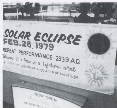
Sign At Winnipeg Airport

Andy comments, "there was great cheering from the viewers, even applause, then dead silence as people concentrated on watching the moon overpower the sun. The first instant of totality was just unbelievable. It seemed very strange to be able to look at the sun, but the sun was gone, only a black hole remained...as if the sun had been punched out of the sky. I suddenly became very selfish and only interested in taking in as much of the event as I possibly could. It did not bother me that something like the blotting out of the sun could happen in the abstract, but when I was seeing it happen, a great sense of identity, of joining with the moving moon, came over me. The end came suddenly...much too soon...there was still so much I wanted to do...to see."