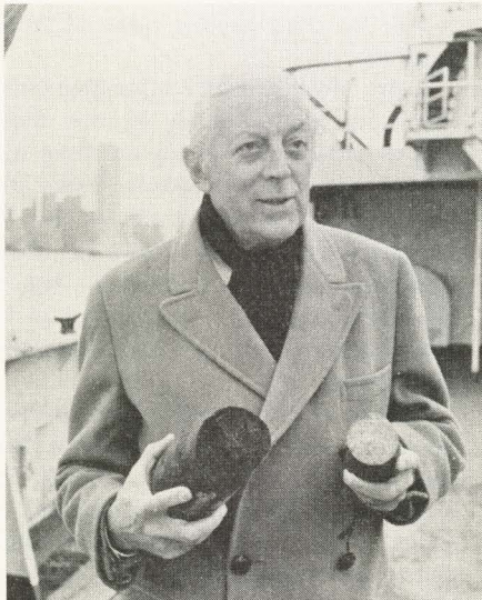
Alistair Cooke in scene from ninth episode of the "America" series, which he narrated.

The Nathaniel Rochester Society of RIT will meet on Jan. 23 for the first meeting of the new year, at the Inn on the Campus.