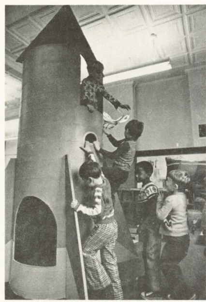
Part of the new environment created by the design students is a climb-in rocket (above), and three dimensional sculptured wood chairs (below).