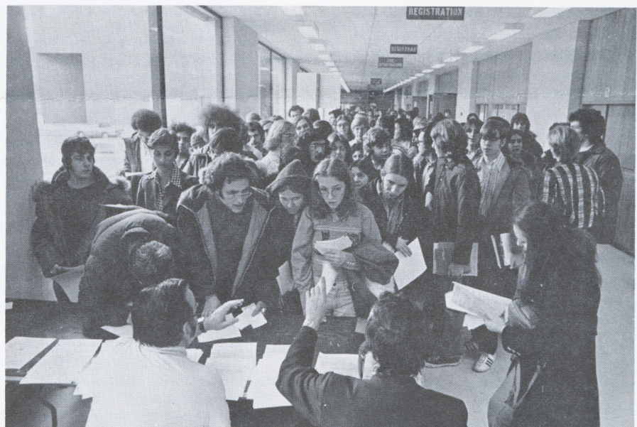
It was Winter quarter pre-registration last week and the administration building lobby looked like this most of the time. Undergraduate and graduate registration will be held again January 3, and classes begin January 4.