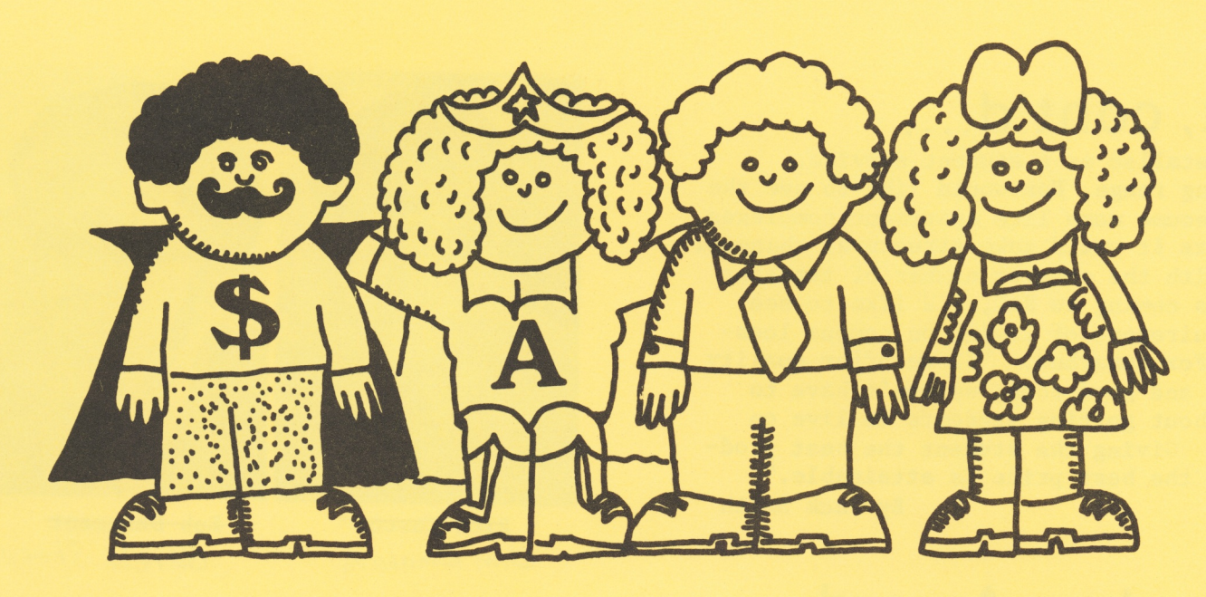
Cartoon characters in Alumni fund drive mailer are (1 to r) Milton Moneymouth, Alice Alumni, Ferris Reel and Tallulah Tingle.