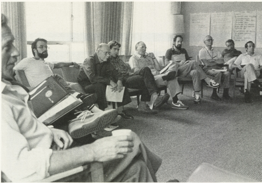
School of Photographic Arts and Sciences faculty members listen attentively to workshop presenters during their weekend faculty retreat.