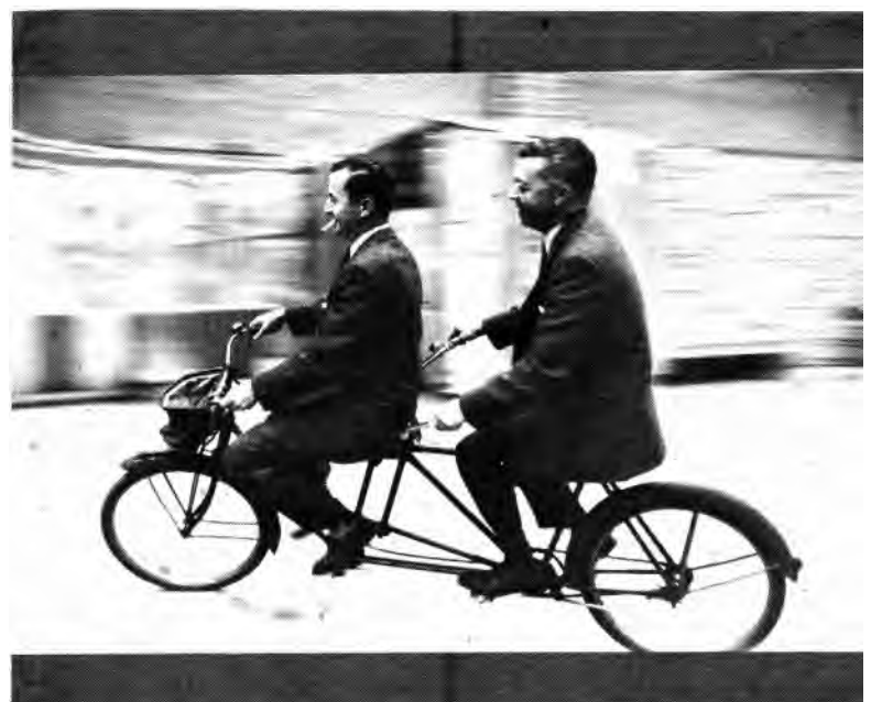
TRoublesome Twosome—Modern administrative members take practice run around RIT "slanted" patio. Run went well until members of the Locust Club cracked down and required a $2 license from the team.