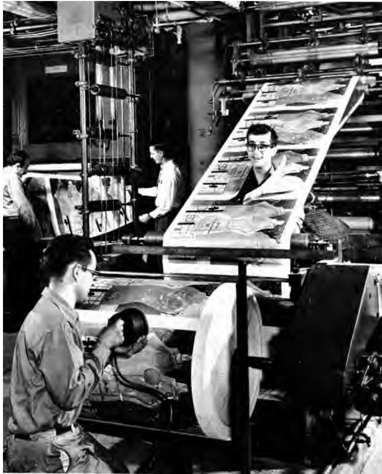
REPELLER AD COME ALIVE—It pays to advertise in the Repeller as this photo advocates. Graphic Arts Research adds the necessary evil matter that makes the ads really stand out. Note: They also usually forget to put rules around the ads.