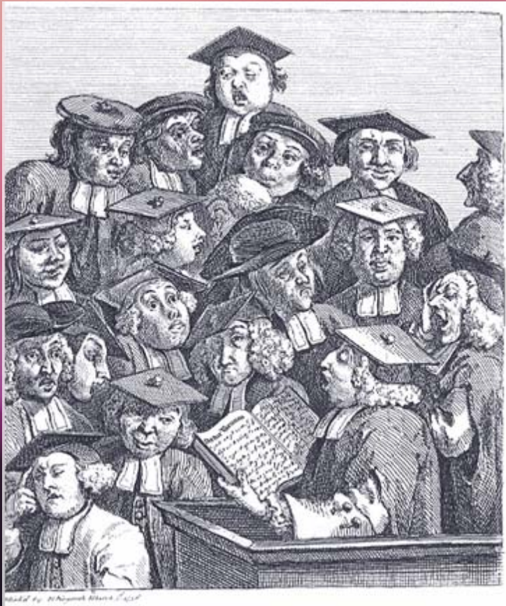
William Hogarth, Scholars at a Lecture . (etched and engraved 1736/7)