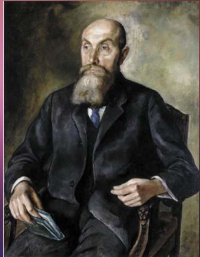
Professor Franciszek Bujak, Kramsztyk, National Museum in Cracow