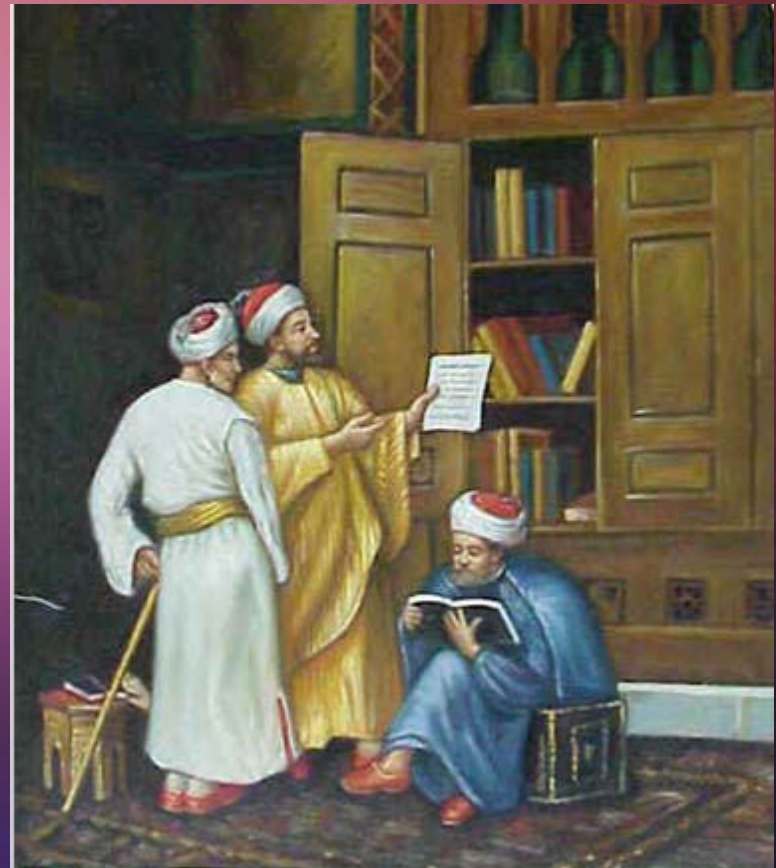
The Role of [Islamic] Social Scientists