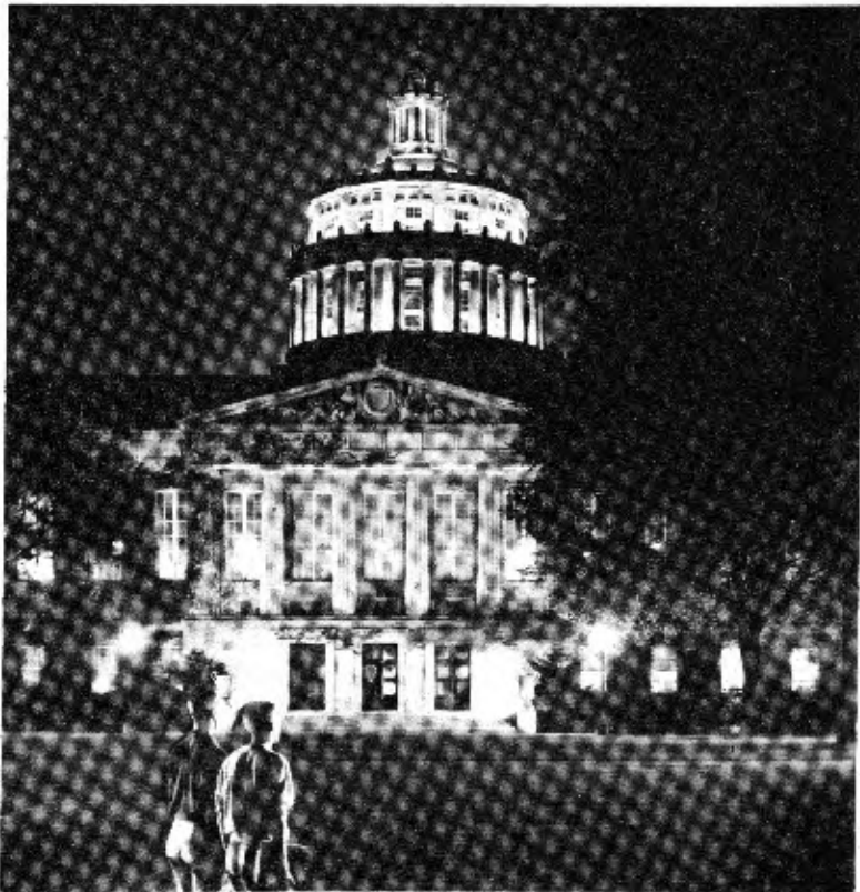
FAA investigators have ordered UR officials to remove the Tower from this beautiful edifice because they feel it will be a hazard to jet service to Rochester.

U of R advances in consoling and education seem prevalent for the centuries to come.