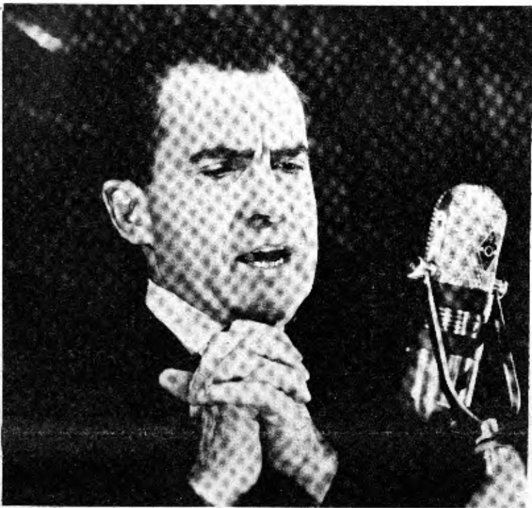
Newly appointed UR High Professor puts on show at a recent press conference. He was demonstrating the techniques of gaining sympathy in politics.

Officials expect that the new system will encourage more girls to attend the U or R by decreasing the accident rate of girl's rushing to meet nightly curfew deadlines. With the added responsibility and convenience the U or R hopes to win a major battle in women suffrage.