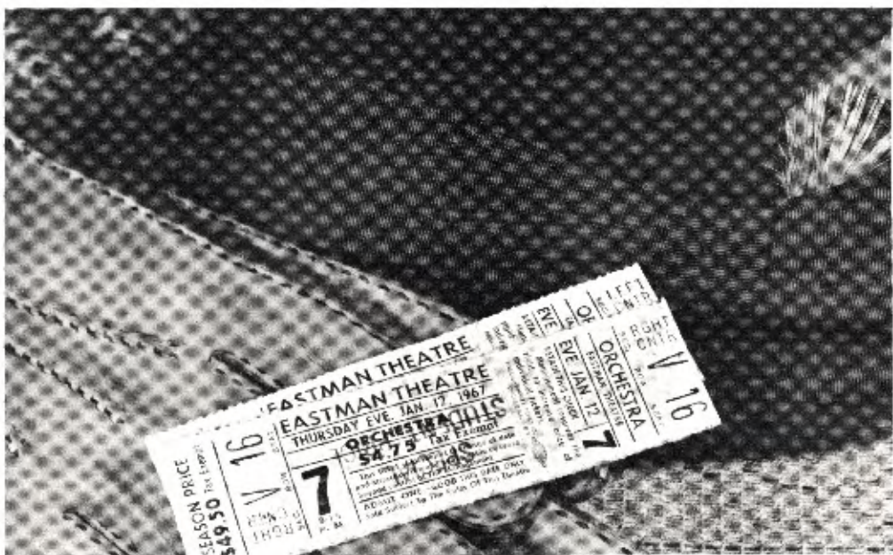
NIGHT ON THE TOWN — Student Activities Center continues to offer free student tickets to cultural events around Rochester.

Tickets will be on sale today in the lobbies of Eastman Building and 50 Main Street W. They are also available from any Glee Club member.