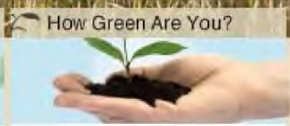
How Green Are You?

The Three Simple Steps Information about Recycle Mania is coming soon!