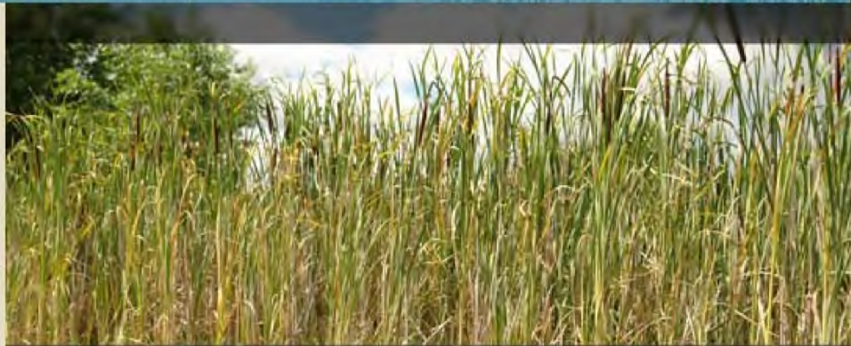
Restoration of native plants on RIT grounds. ↩ ↗