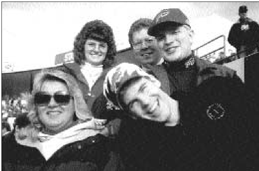
Hooray for Buffalo! Alumni and students are all smiles as they cheer for the Bills at Rich Stadium.